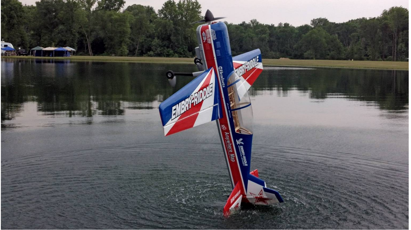
One has to be a great pilot to pull this off successfully. It looks like he's baptizing the plane.