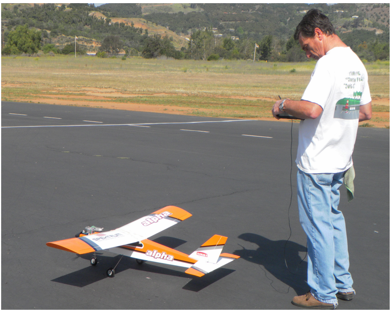
Todd Melton preparing a trainer for flight.