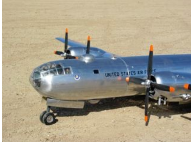
It has full dress aluminum skin.