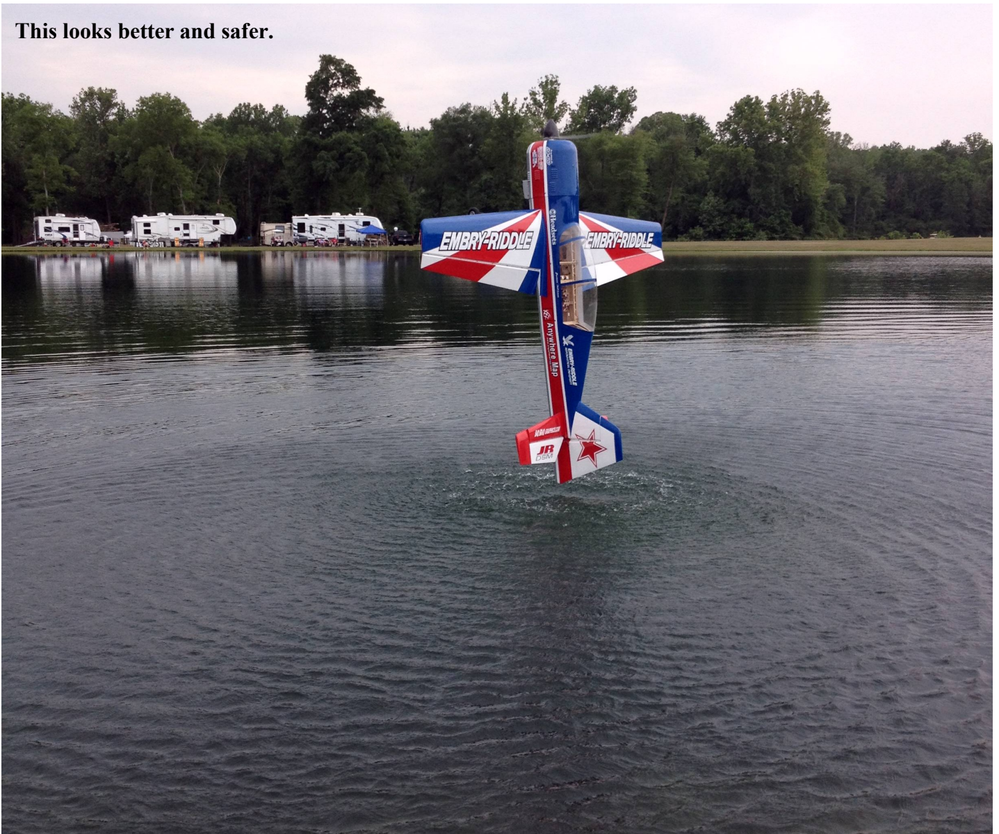
This looks better and safer.