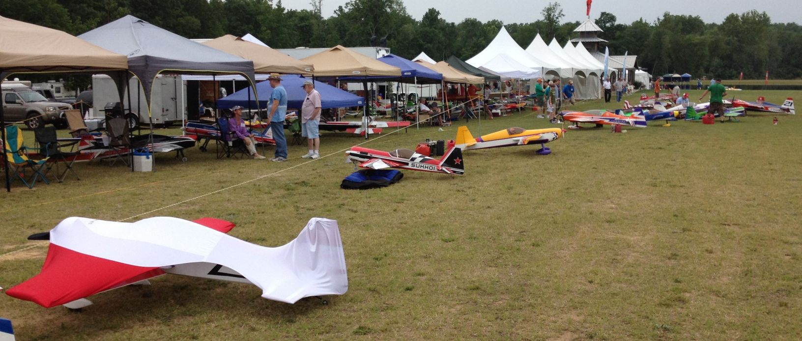
This is the final photo of the Joe Nall event. Note the way the first plane is covered!