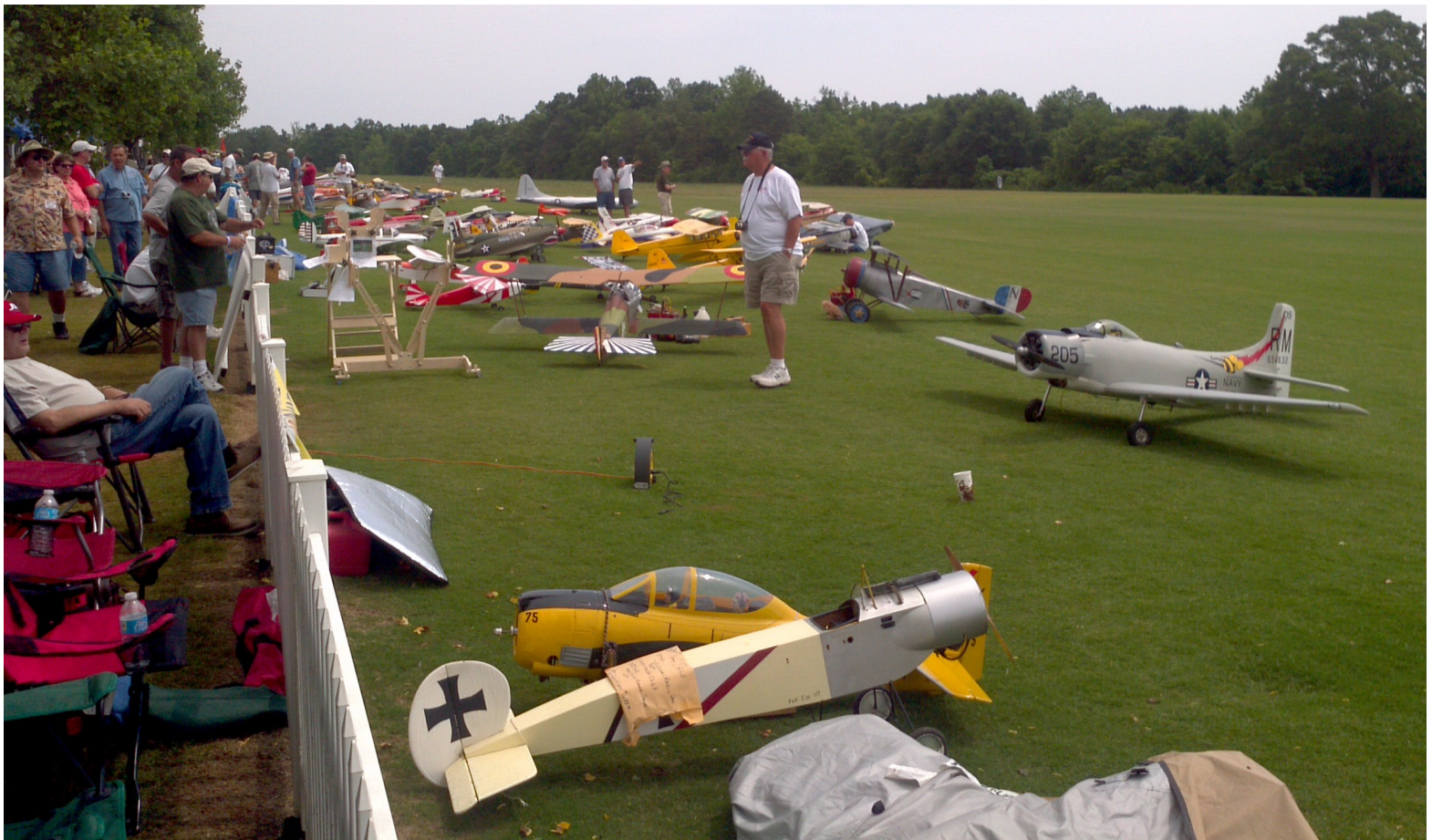
The Joe Nall meet is one of the largest gathering of pilots and B-I-G planes in the USA.