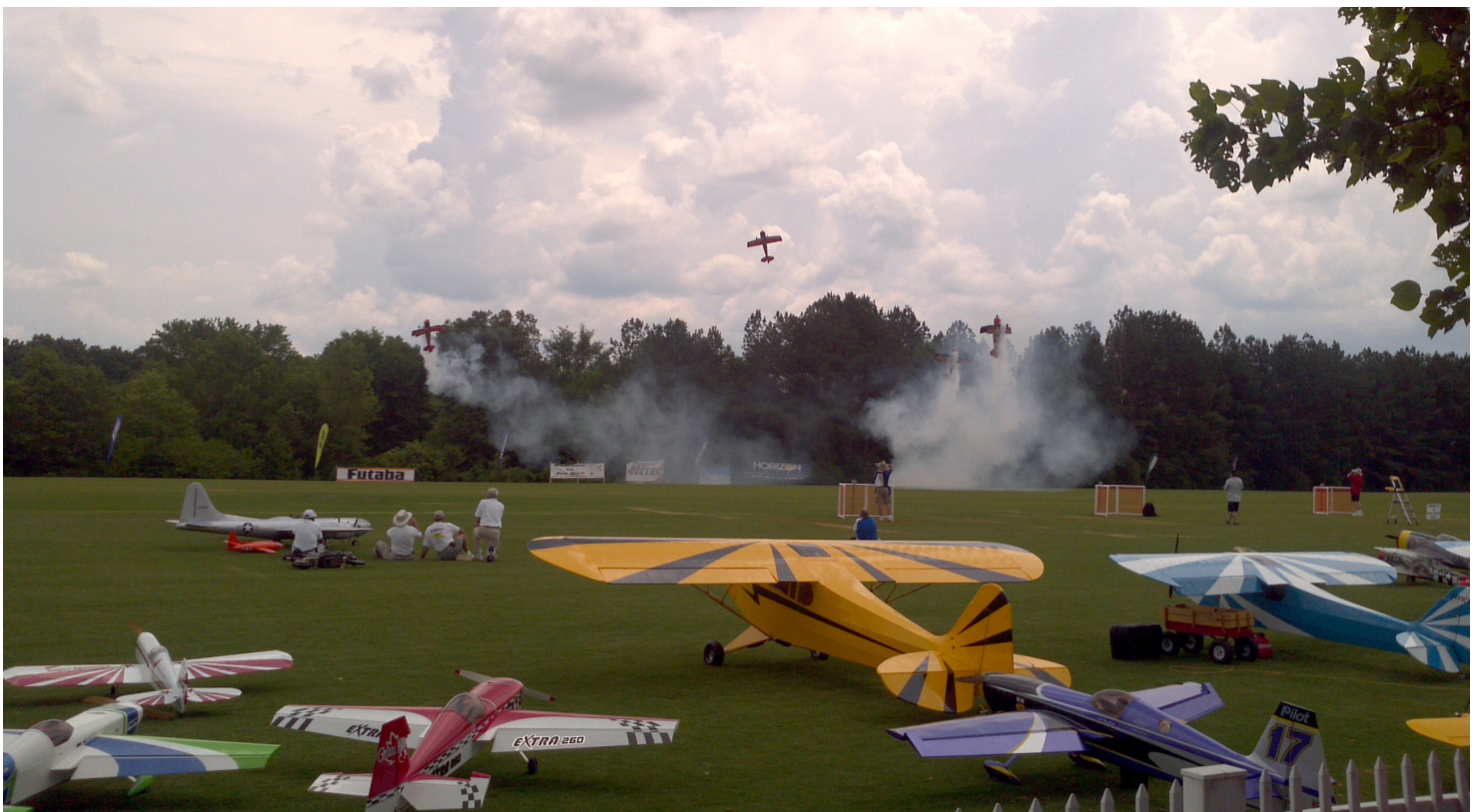
These three 3-D planes in the air created lots of smoke and excitement.