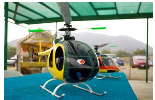
(face on the front are just decals)