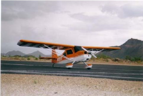
(Actual model. Taken in Arizona)

1/3 scale Citabria. 138" wingspan. 3W-78 twin.