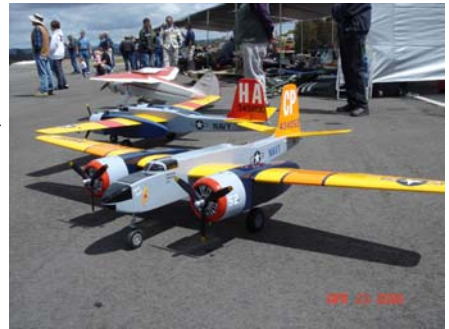
Model in foreground. Taken at fallbrook airport

) A-26 built from plans. 96" wingspan. RCV .91's. Century jet retracts. Complete RTF. $ 1,495.00