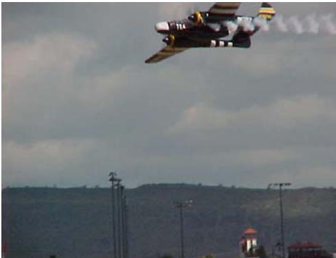
( Actual model taken in Arizona)