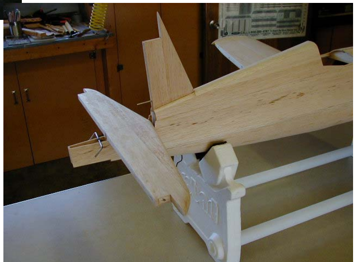
Fit & epoxy horizontal & vertical stabilizer