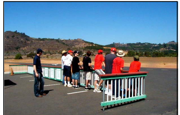
More Pictures from Flights of Fancy