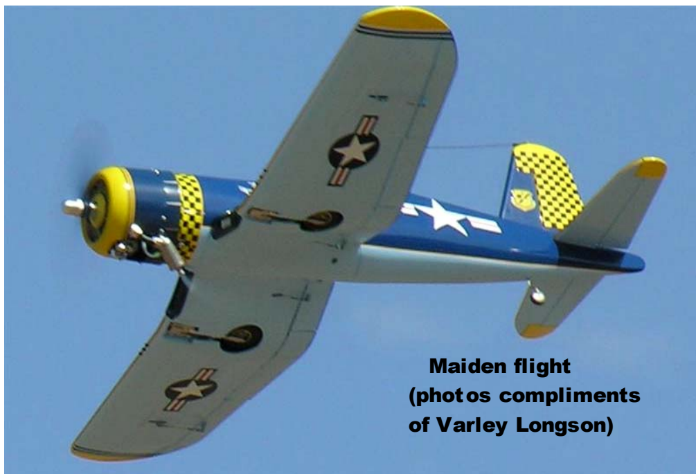
Maiden flight