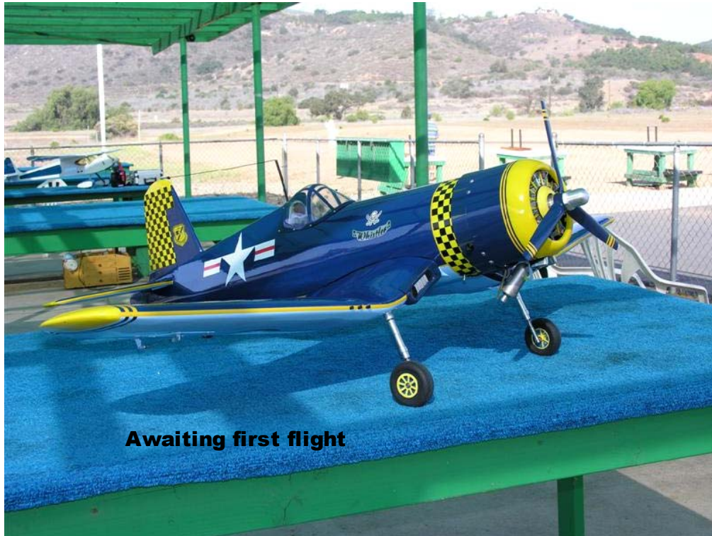
Awaiting first flight