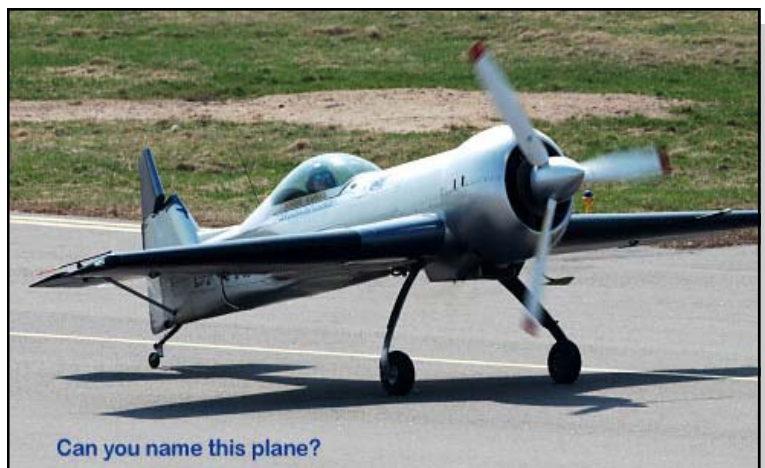
Can you name this plane?