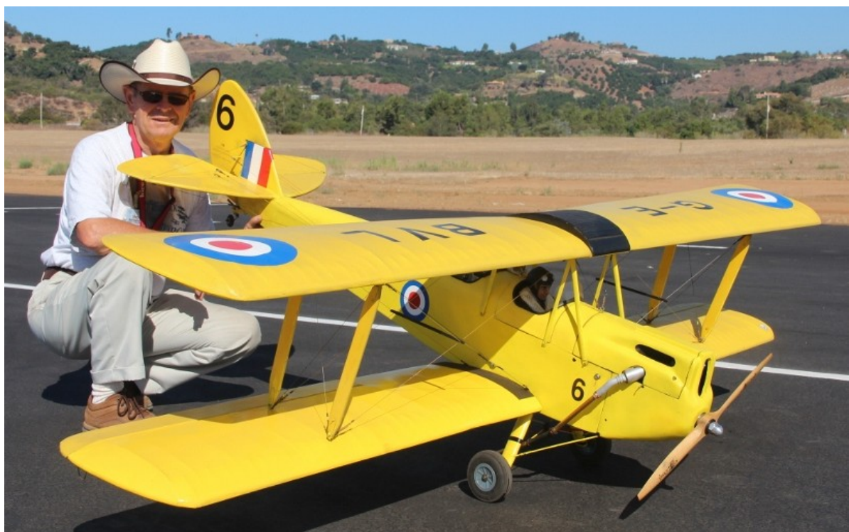
The editor with his slow flying, 20.5lbs. Gypsy Moth. It is 14 years old.