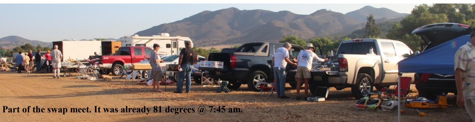
Part of the swap meet. It was already 81 degrees @ 7:45 am.