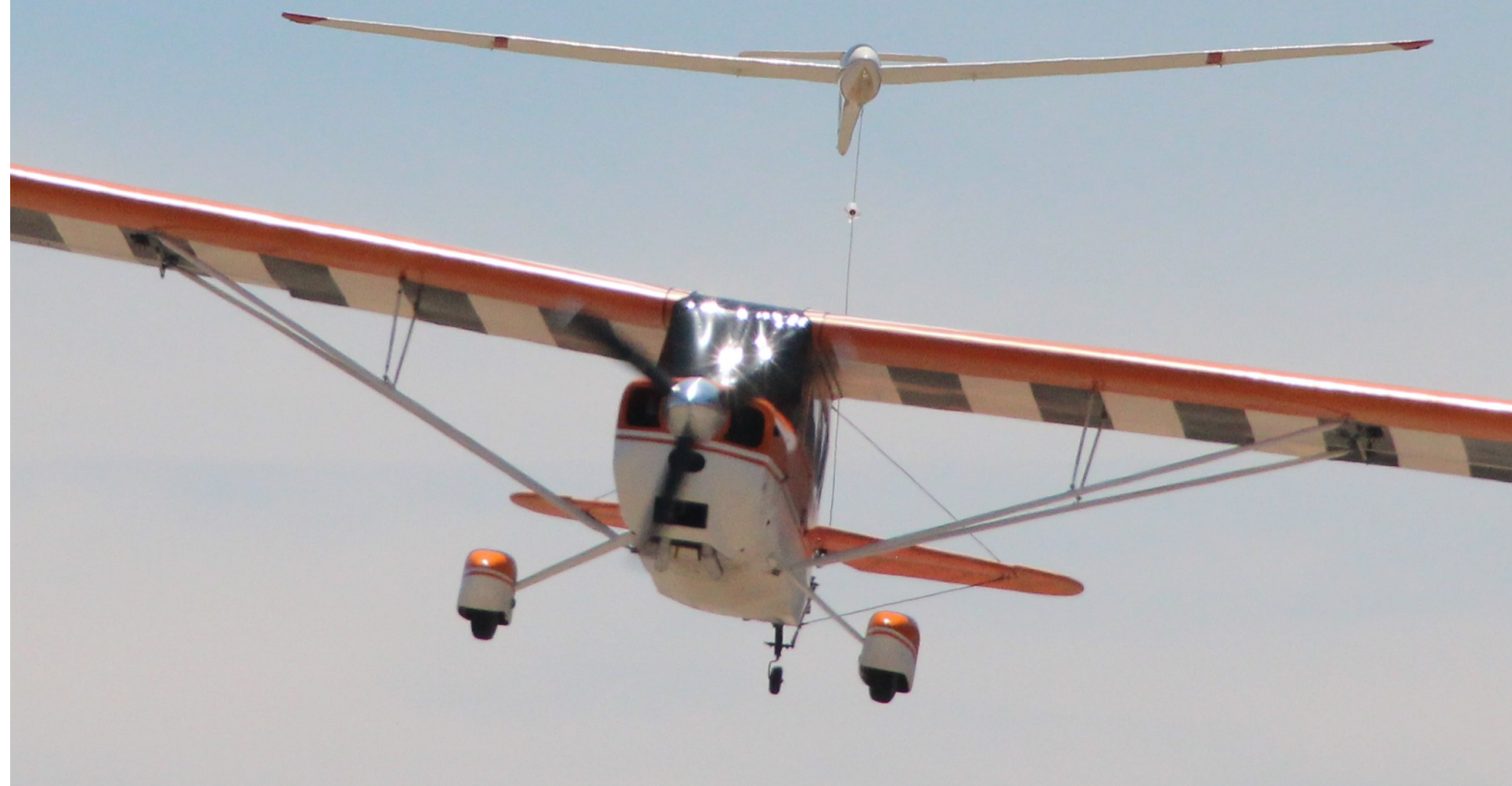
Tom Minegar's 1/3 scale Citabria towing a 4 meter sailplane. It looks full-scale!