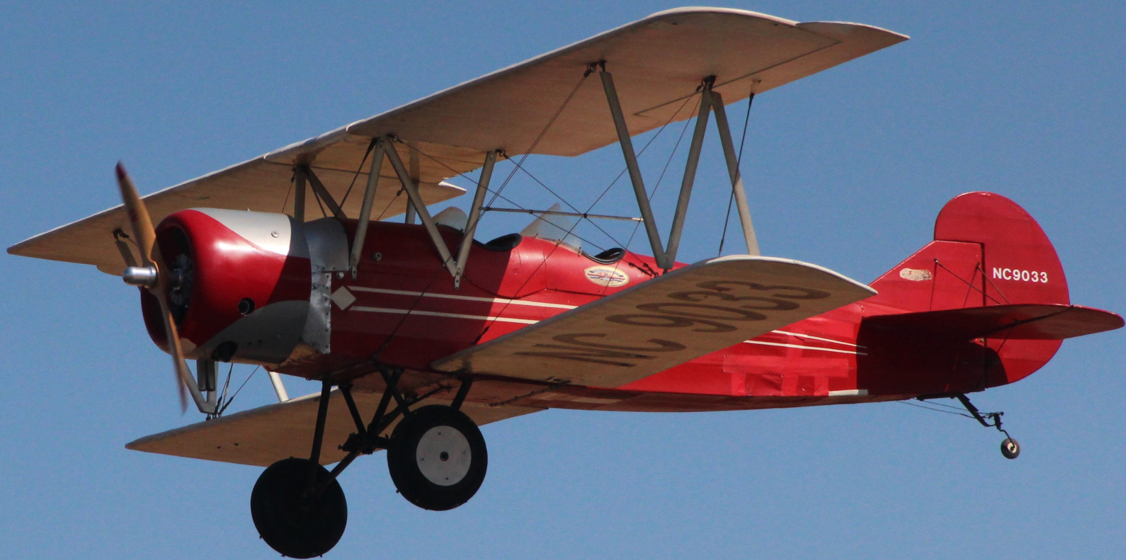
On Aug. 9, 2012 Victor Lanz flew his 9' Travel Air Bi-plane @scale speed when the wind came up.