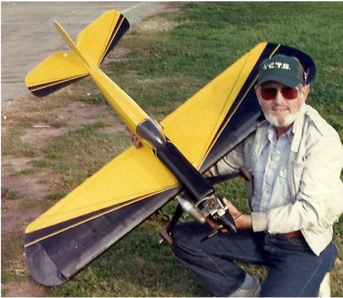
Photo taken in 1990 with a plane that I "kit bashed" from an old Hobby Shack Modeltecch stick ARC. It was supposed to be a high wing and I turned it over and made low wing out of it. I rounded off the wing tips, changed the outline of the tail surfaces, and made it with turtle deck and a canopy. It didn't look anything like a "Stick" when I was done with it. Who is this member? Answer on page 15.