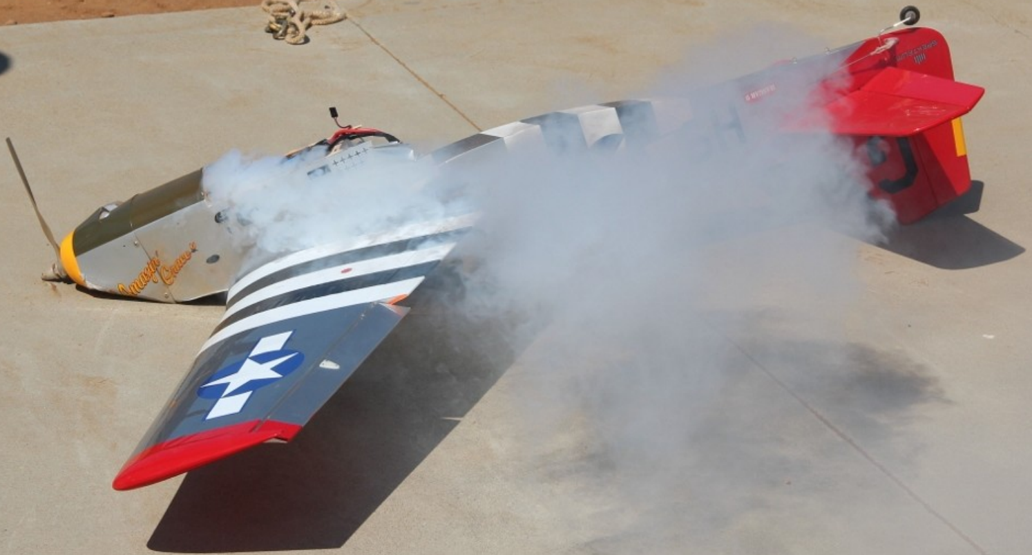
On August 7, 2012, this electric P-51's lipo battery caught fire when it crashed on the dirt alongside the runway. Had it been in the jungle, it could have been a different story!