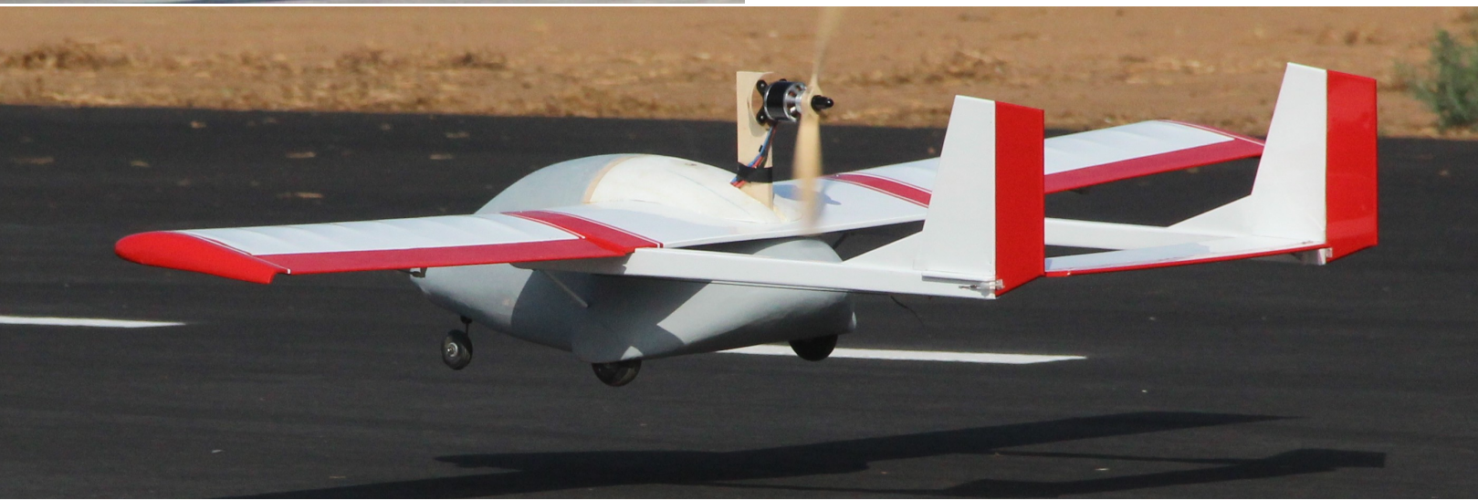
Expert flyer Denver Bates 'maidened' Marv's Skylark. An engine nacelle will be added as on the full scale plane.