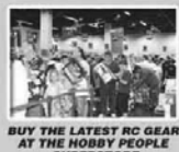
BUY THE LATEST RC GEAR AT THE HOBBY PEOPLE SUPERSTORE