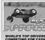
WORLD'S TOP DRIVERS COMPETING FOR CASH

Check out COOL NEW R/C PRODUCTS up close and personal! Shop and save at the Hobby People store at the show!