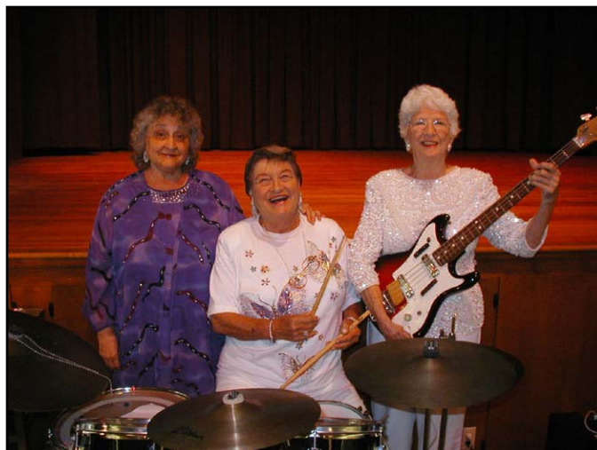
There's those Groov in Grannies again!