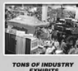
TONS OF INDUSTRY EXHIBITS