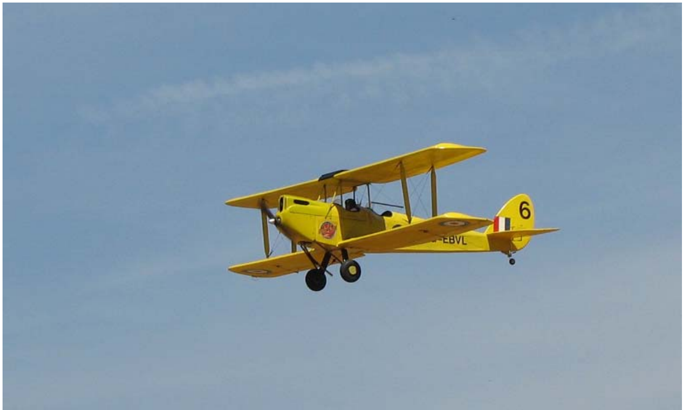
Joe Buko's 1925 Gypsy Moth powered by a Saito 1.20