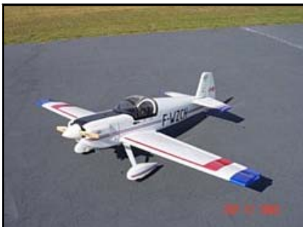
Remember this one? CAP 21

Note: These changes shall be voted upon at the regularly scheduled May 19, 2005 Club meeting in accordance with the Palomar R/C Flyers, BY-LAWS, Section VII and STANDING RULES, Section I, Sub-section E