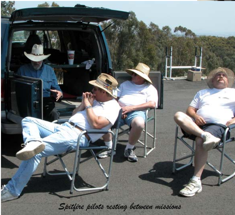
Spitfire pilots resting between missions

These are all the pictures we had of the Fallbrook air fair. Sorry that so many others did not get represented, we'll see if we can do better at Romona