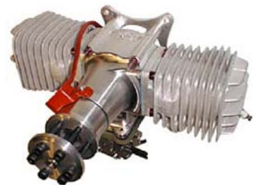
Desert Aircraft DA-100