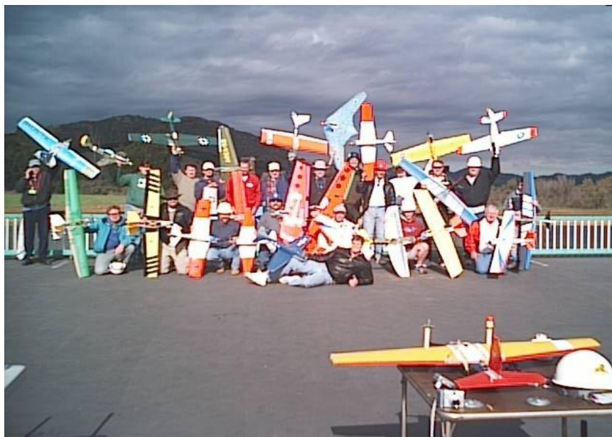
The December 4 th , 2004 Combat Pilots