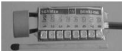
Here's what it looks like!