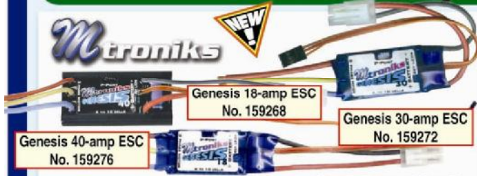
Genesis 18-amp ESC No. 159268