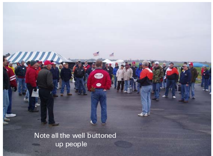
Note all the well buttoned up people