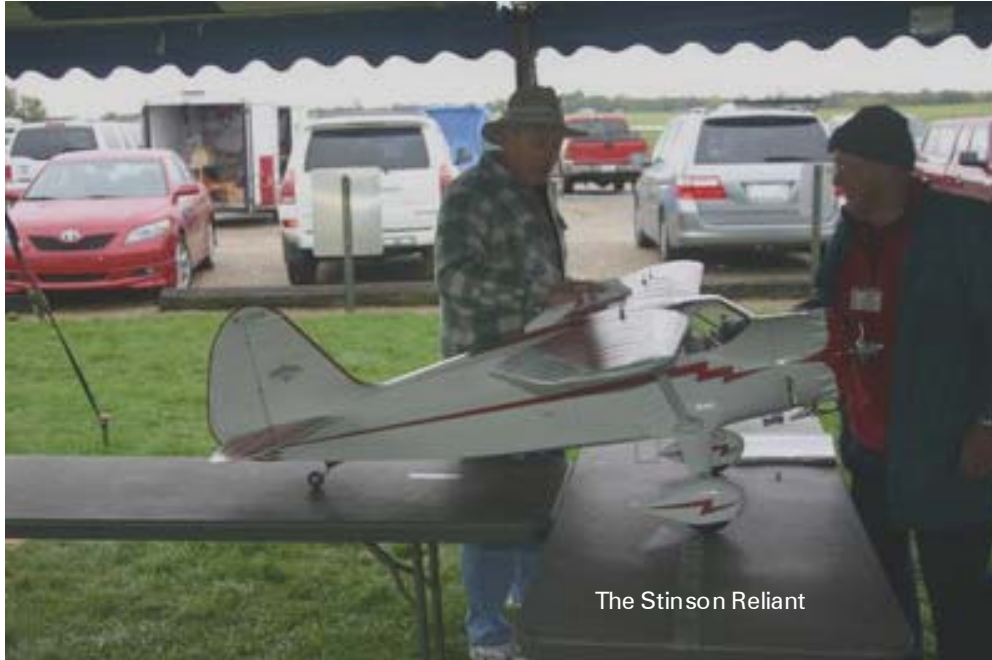
The Stinson Reliant