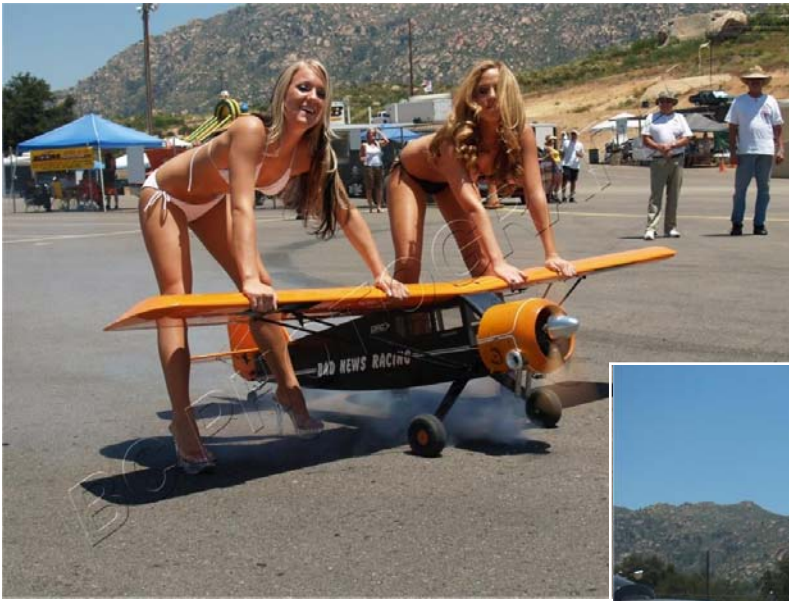
Barona event Last month